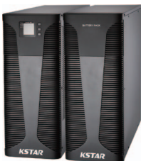
Battery Cabinets. (Optional)